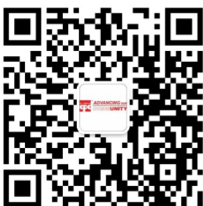
CPC WeChat QR Code

For more information and updates, please visit www.cpc-nyc.org