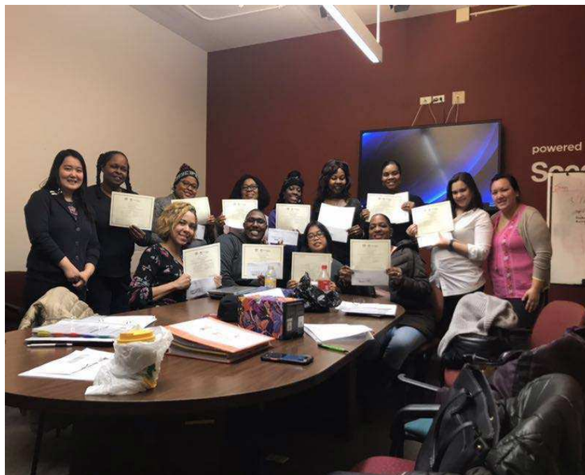
Graduation Celebration of the 120-hour CDA Course

CPC-ACCR has finished its training sessions for quarter one with great outcomes. Among these include our 30-Hour Cohort Training, SUNY Health & Safety and First Aid/CPR in Korean, whose class is pictured above. This marks the second year we have offered the 30-Hour Cohort training in Korean at our Queens Community Center and our commitment to assisting New York's Korean-American community! In addition to our fledgling Korean-language programs, we have also completed our third year of 120-Hour CDA courses, the 30-hour Cohort, First Aid/CPR, SUNY Health & Safety, and Medication Administration Trainings (MAT) in English and Chinese. All of this has been possible due to our cooperation with the United Federation of Teachers, and we look forward to our continued cooperation.